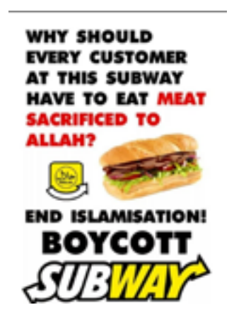
Figure 2: Anti-Islamic Meme posted on Daily Stormer, 3/6/17

appended Jewish names with such parentheses; users often manually add echo parentheses to posts in far-right online spaces. The goal is to demonstrate the extent to which Jewish people are present in elite circles and upper echelons of media by drawing attention to how frequently they are mentioned in the press.