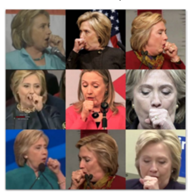
Figure 4: Hillary's Health Photo Collage

Before long, more mainstream conservative news outlets, such as the Drudge Report , began to question the state of her health, discussing Clinton's former blood clot, as well as instances in the past when she had fallen.<sup>246</sup> Sean Hannity devoted multiple nights of coverage to these issues on his Fox News show, in which he brought on various medical experts to speculate on the state of her health.<sup>247</sup> Most of these sources did not fully endorse the conspiracy theories, but they profited off them all