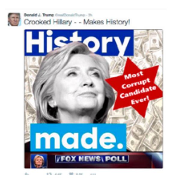
Figure 3: Hillary Clinton Meme Tweeted by Donald Trump

On July 2, 2016, Donald Trump tweeted an image of Hillary Clinton next to a Star of David graphic labeling her the "Most Corrupt Candidate Ever!" (Figure 3).<sup>235</sup> The image's background consisted of piles of U.S. currency. The combination of the Star of David, the money, and the suggestion of corruption evoked stereotypical ideas about Jewish people and referenced conspiracy theories about Jewish control of monetary systems.<sup>236</sup> National media outlets immediately noticed the image's anti-Semitic references and published critical responses or stories highlighting the social media backlash.<sup>237</sup>