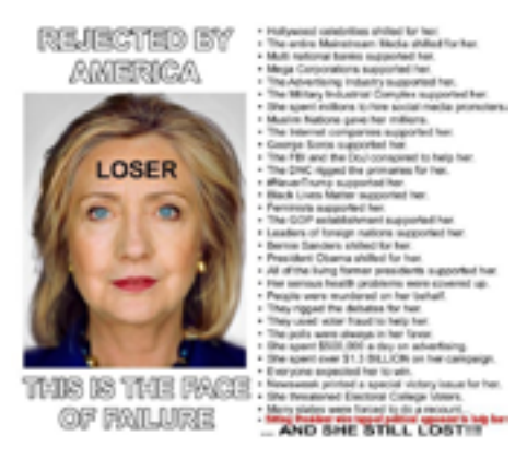
Figure 1: Anti-Hillary Meme posted on Daily Stormer, 3/6/17

macro in Figure 1). The milder images are intended to work as "gateway drugs" to the more extreme elements of alt-right ideology.